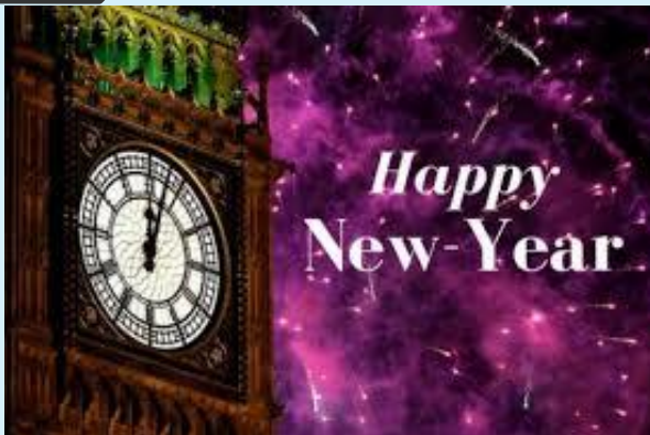
The New Year