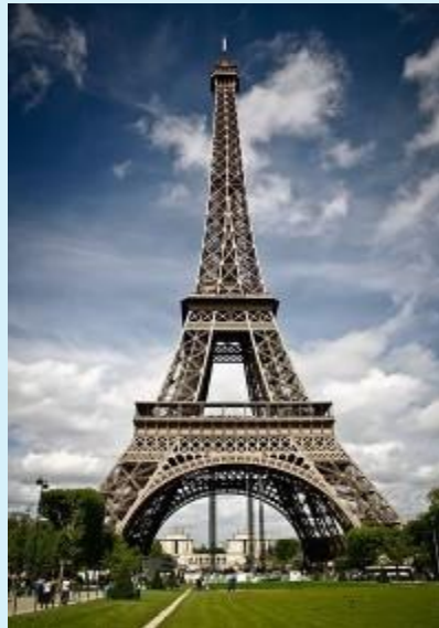
The Eiffel tower