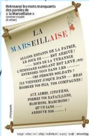
The Marseillaise song