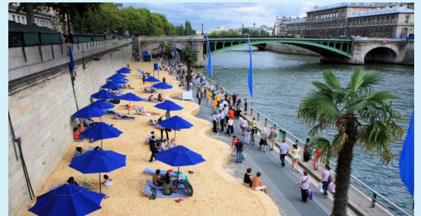
The Beach on the edge of the Seine river