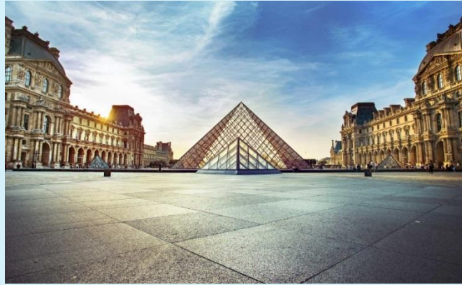
The Louvre Museum