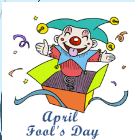
April Fool's day