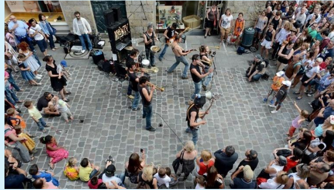
World Music Day